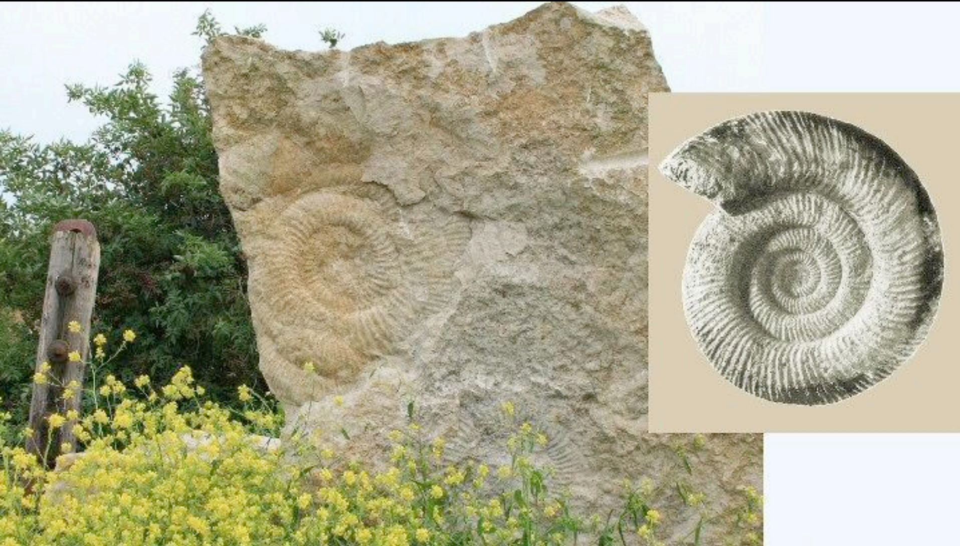
Giant Ammonite ( Titanites anguiformis ) displayed at St. Aldhelm's Head quarry, England.